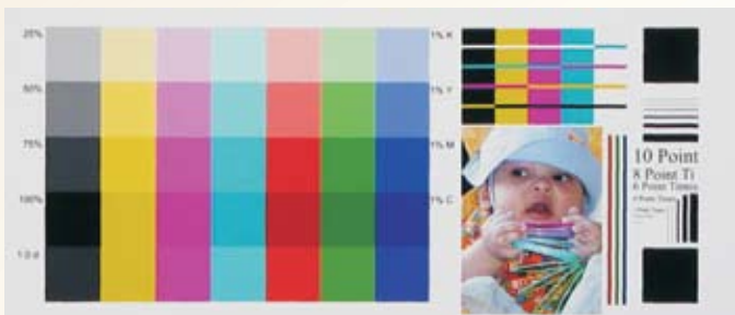
Color photographic test print, after being immersed in water and air-dried.

Black-and-white heritage photographic prints consist of a metallic silver image within a gelatin layer. When properly processed and stored, these are the most stable images available. They are also very resistant to water damage. Even after a day in water, silver images show no discernible change. A slight discoloration in white