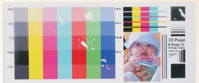
Ink jet pigment print on microporous paper, after immersion in water and blotter-drying. Flaking of image can be seen. Image shows no dye bleeding.