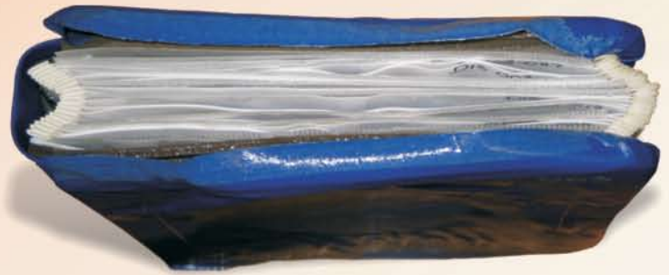
Water-soaked album showing cover damage and page distortion.

of fabric, plastic, paper, or leather may separate from the cover's cardboard core. The adhesive securing the pages within the album cover may dissolve. Although some pens used for labeling and journaling are water-resistant, many are water-soluble and will run, causing identifying information to be lost and possibly damaging the prints. Dyes from the cover, embellishments, or memorabilia also may bleed and discolor the prints. When albums have been flooded by cloudy or dirty water, sediment can collect between the pages.