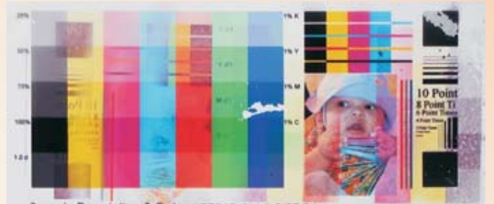
Ink jet dye print on microporous paper, after immersion in water and blotter-drying. Some flaking, dye bleeding, and image transfer are evident.