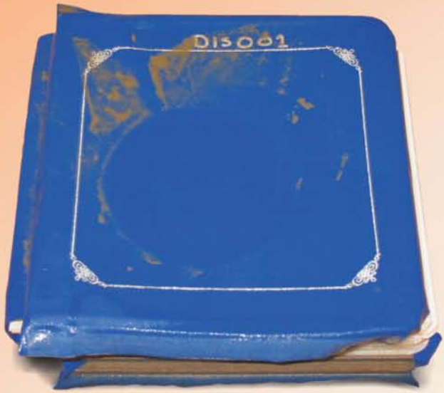
Water-soaked album showing cover damage.